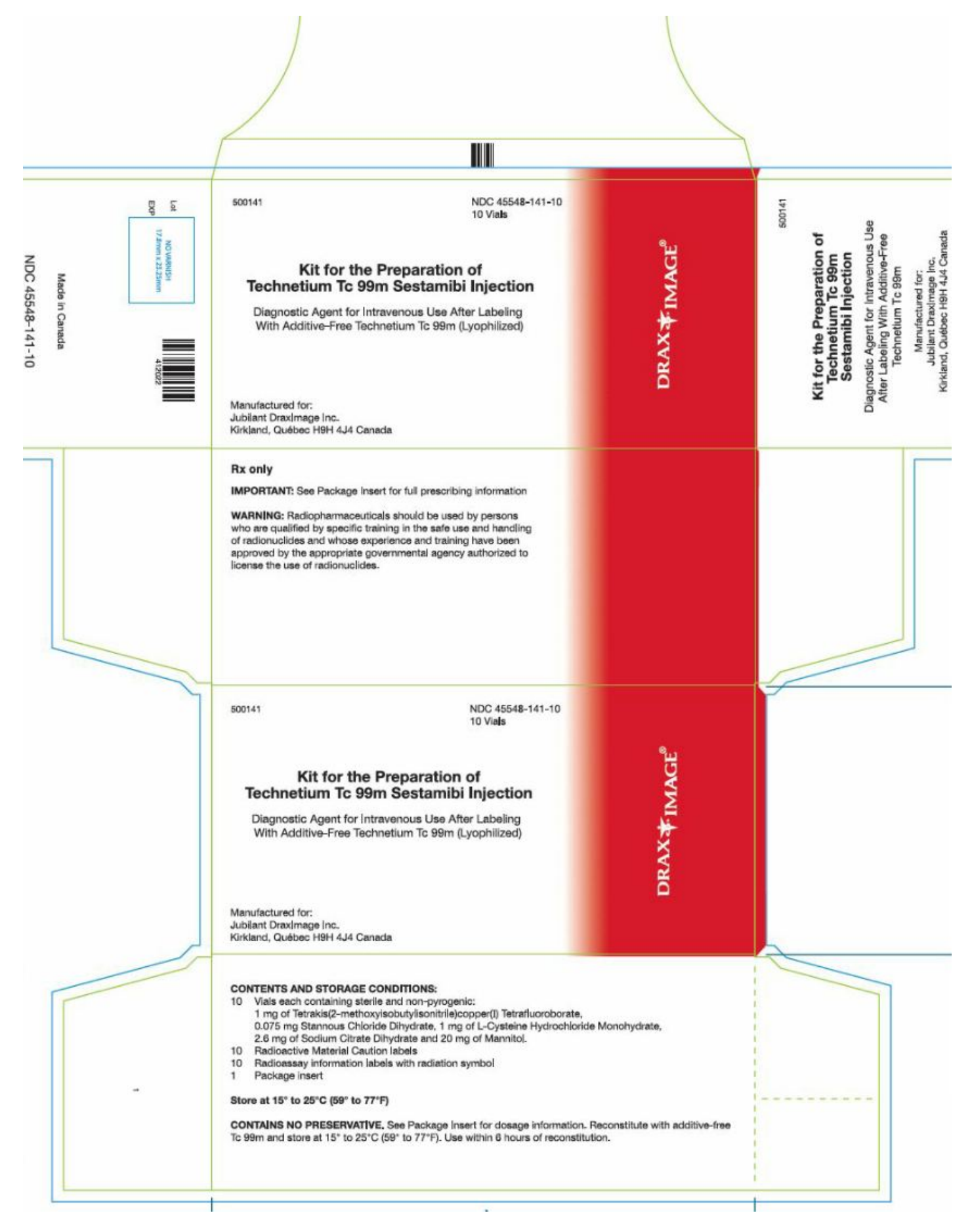
Kit for the Preparation of Technetium Tc 99m Sestamibi Injection